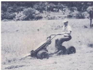
MOW PASTURES, WEEDS