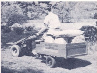
HAUL 1/2-TON LOADS

Height of cut is quickly adjustable. Design simplicity, with two heavy-duty knives, means low-cost maintenance, almost unlimited service.