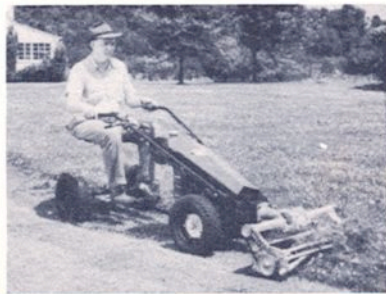
MOW FINE LAWNs