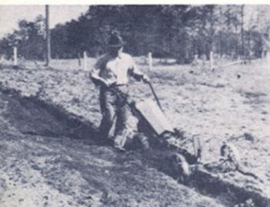
PLOW PERFECT SEED BED

You can see for yourself the many ways the Gravelly will save you time, work and worry—give you the ease and convenience of POWER to make your tough jobs easy!